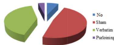
Fig.2 Distribution of Plagiarism Types

In general, students were still doing plagiarism. From figure 2 showed that the highest type of plagiarism was Sham (the source was mentioned, but the method of quoting was wrong). The second type of highest plagiarism was Verbatim (copying the source word for word without citing the source, so the presentation of the material was regarded as one's own). The third type was Purloining (copying the work of others, both with